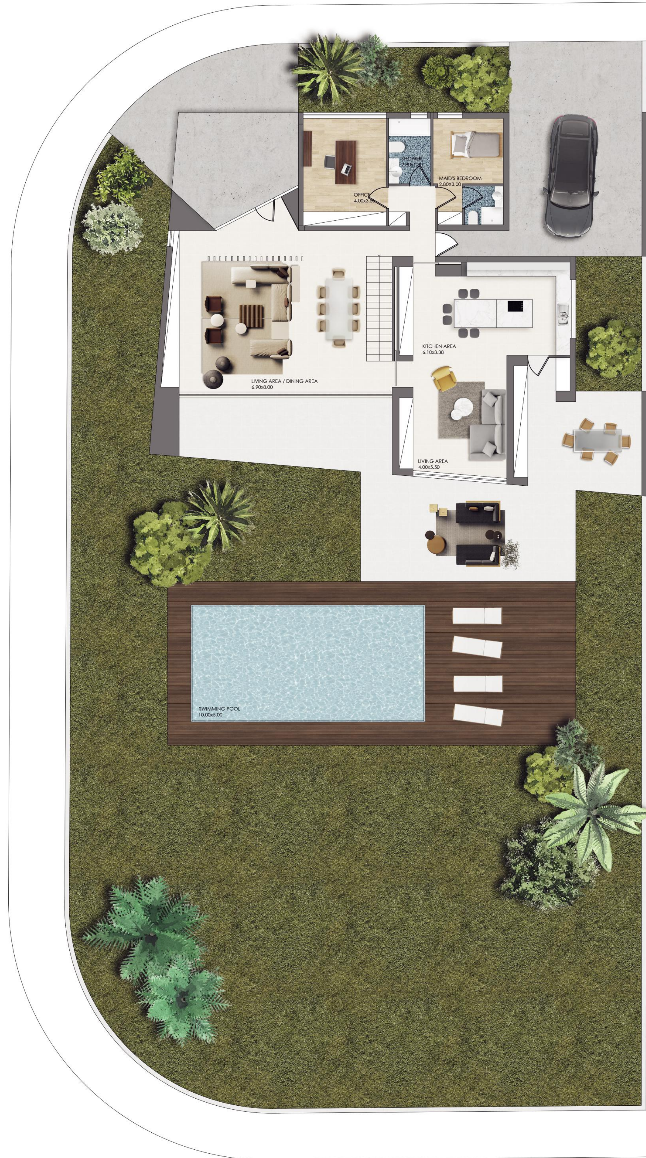
1:100 GROUND FLOOR PLAN