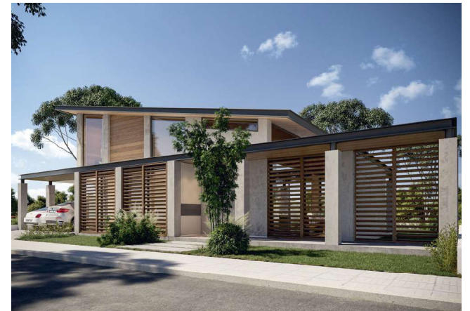
The Pine Villa