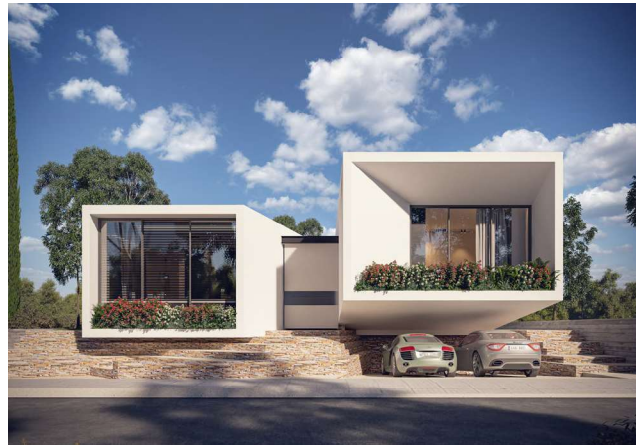
The Rosemary Residence