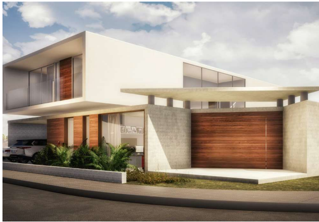
The Dahlia Villa