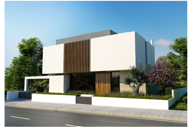
The Wisteria Residence