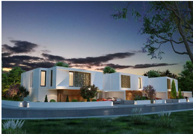
The Sunflower Villas